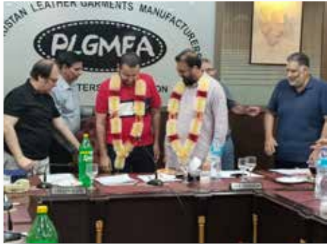
The 1st meeting of 21th Executive Board of Pakistan Leather Garments Manufacturers & Exporters Association North Zone Held on September 14, 2024 at PLGMEA Northern Zone Office Conference Hall, Sialkot